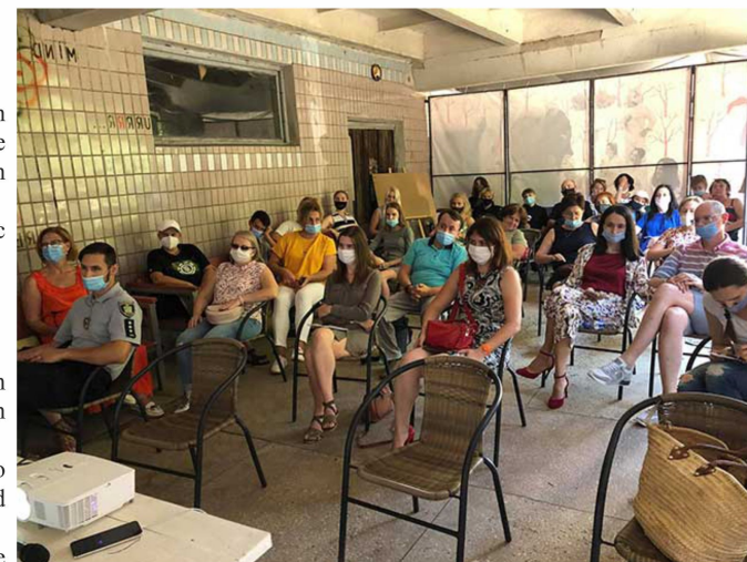
The method is based on spatial research, interviewing the residents and analysis of

In order to make the project possible, NGO Information Resource Center "Legal Space" signed a MEMORANDUM OF COOPERATION in the implementation of "Creating a public space in Suvorov Str." . The memorandum was signed between Kherson city council, Main department of national police in Kherson region, Patrol police department in Kherson region, NGOs "KRC "Successful woman", "IRC "Legal space", "Center of cultural development "Totem".